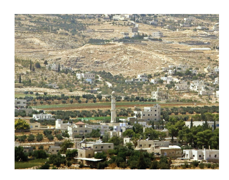
MOSQUE AND MINARET, Village of Teqoa, south-east of Bethlehem, Palestine.