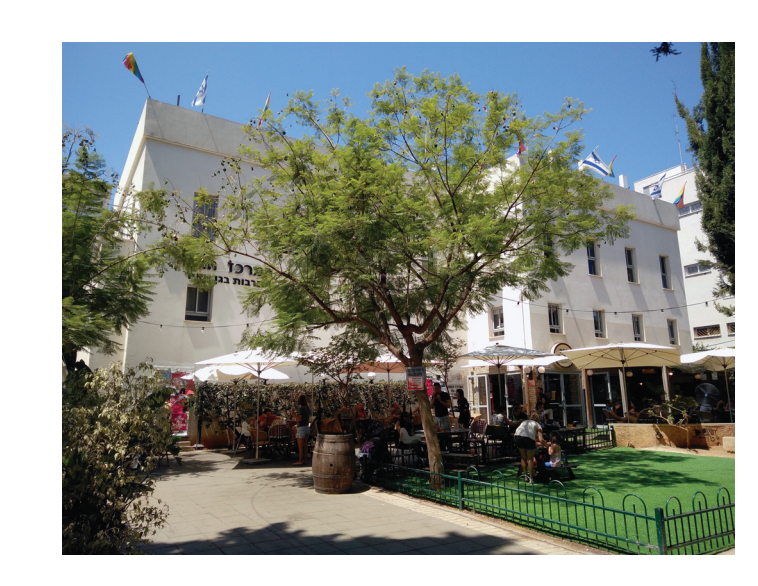
LGBT CENTER, Tel-Aviv, Israel: Formerly, the General Federation of Students and Young Workers Center completed in 1940; later re-purposed as the Dov Hoz professional school; and since 2008 Israel's first Lesbian, Gay, Bisexual, and Transgender public gathering place.