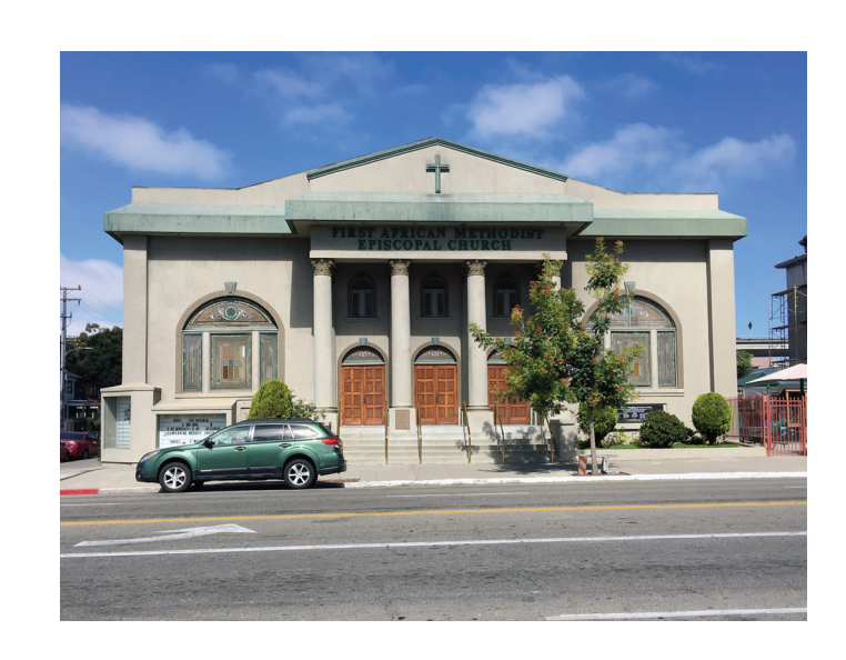
FIRST AFRICAN METHODIST EPISCOPAL CHURCH, Oakland, California, U.S.A., 1902. Congregation founded by free African Americans in 1816 as part of a nationwide movement in the United States.